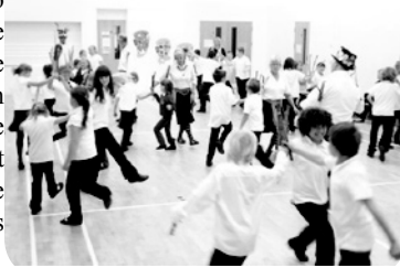
(Above) Kilkhampton Primary School (Below) Otterham primary School.