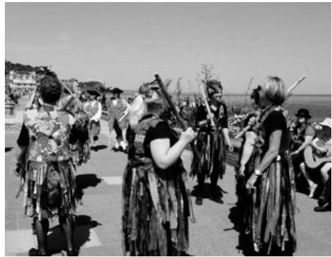
Right : Winterbourne Down Border Morris Below: Hobos Morris