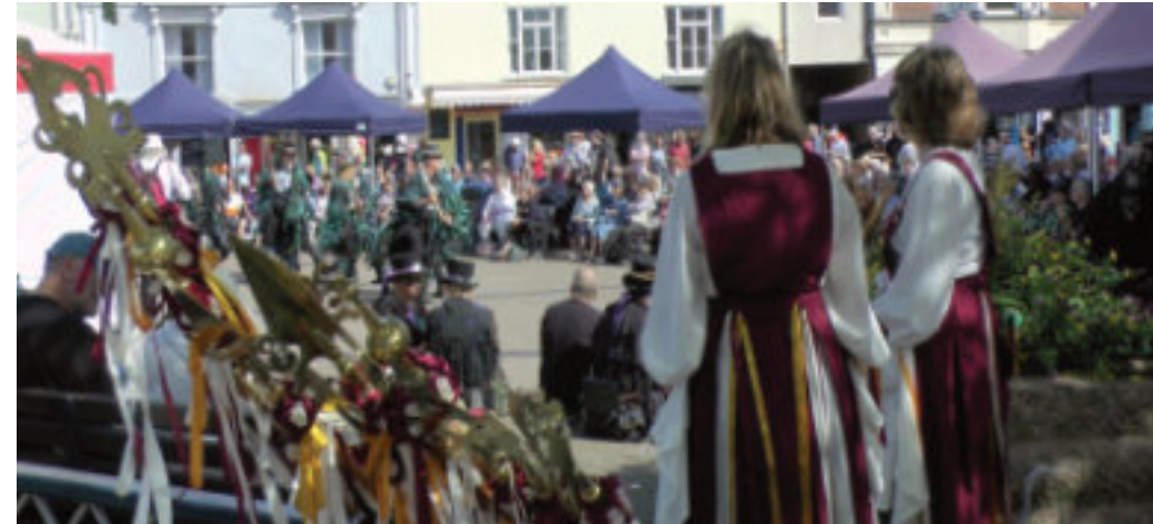
ON THE BORDER: Lodestone Border Morris of Tavistock performing at Teignmouth

THE 21st Teignmouth folk festival was a great success, even if the weather on Sunday afternoon tried its best to dampen proceedings for an hour or so at the outside stage. Nevertheless, the show went on and Papa Gator and the Levee Breakers were a great hit in their first appearance at the festival although the audience was smaller than usual.