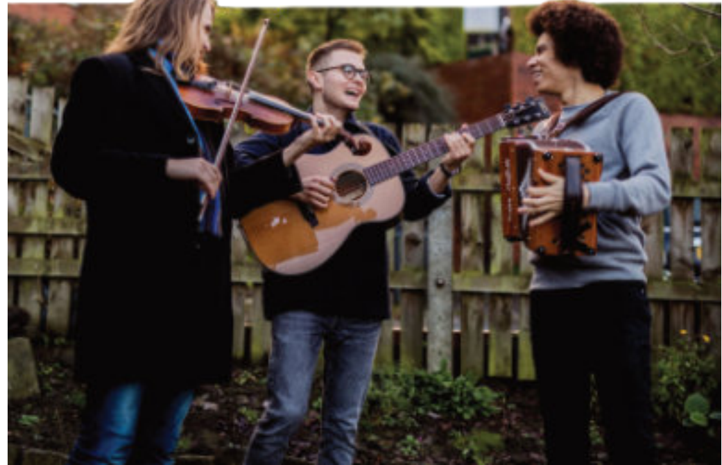
WEATHER BEATEN: Granny's Attic were having a great gig until Sidmouth's Bulverton Marquee had to be evacuated when the storm hit

'As the marquee was being evacuated, people were queuing to buy our CD'