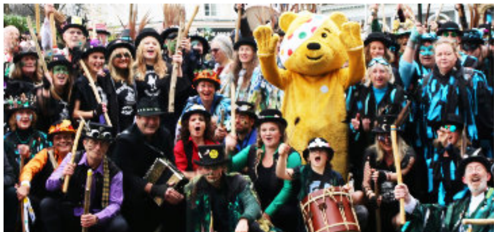
MASSED MORRIS: Just some of the dancers and musicians who turned out for Children in Need cluster round Pudsey Bear in Tavistock's Bedford Square for the annual fundraising event