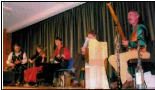
Above, right: New Scorpion Band in concert