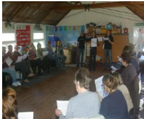
Singin' Spring 3