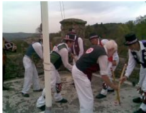
Tinners Morris perform on a church tower on Dartmoor

Full details of the programme for the weekend and the Saturday tours are given in the display advertisement in this magazine.